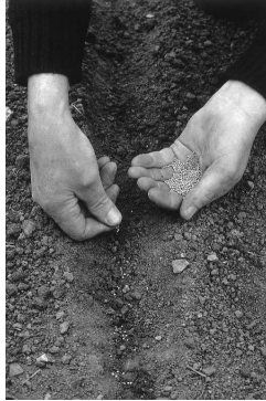
Reap what you sow.

Stay tuned for an alert targeting Senators later this spring, as AB 541 now moves to the Senate.