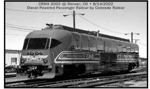
The Draft EIR shows environmental benefits by removing 100,000 pounds of greenhouse gases daily.

As a prerequisite to the vote, the environmental impact study examined the possible adverse environmental impacts of rail service. Largely missing from the environmental analysis was anything that supporters could point out as evidence of the benefits of the project. For example, we know that passenger rail service encourages Smarter Growth, including infill housing and commercial activity, with more walkable neighborhoods than at