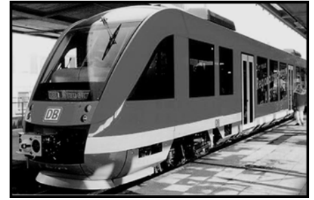
An example of a possible SMART locomotive.

it is easy to miss the most important benefits of passenger rail service. While often ignored in the report, the benefits of passenger rail service are many.