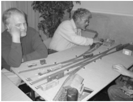
The Sonoma County Model Railroad Society with their interactive rail and switch display.