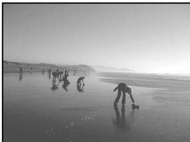
Beach remediation in Bay Area

Our team of biologists, mycologists and educators are taking the initiative to explore various approaches to the bioremediation of petroleum contamination. Bioremediation is a process ac-