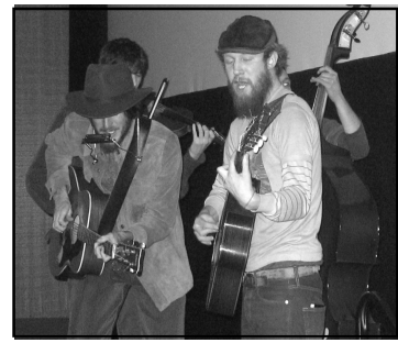
The Crux at Rialto Cinemas

SCCA's living breathing Know Your Neighbor (KYN) Program is excited to be welcoming more precincts, more people, and more fun events! We just had a wonderfully successful time with SCCA Movie Night at the Rialto Cinemas Lakeside on January 31. Nearly 200 people turned out to see the inspiring film "Baraka," hear from Santa Rosa City